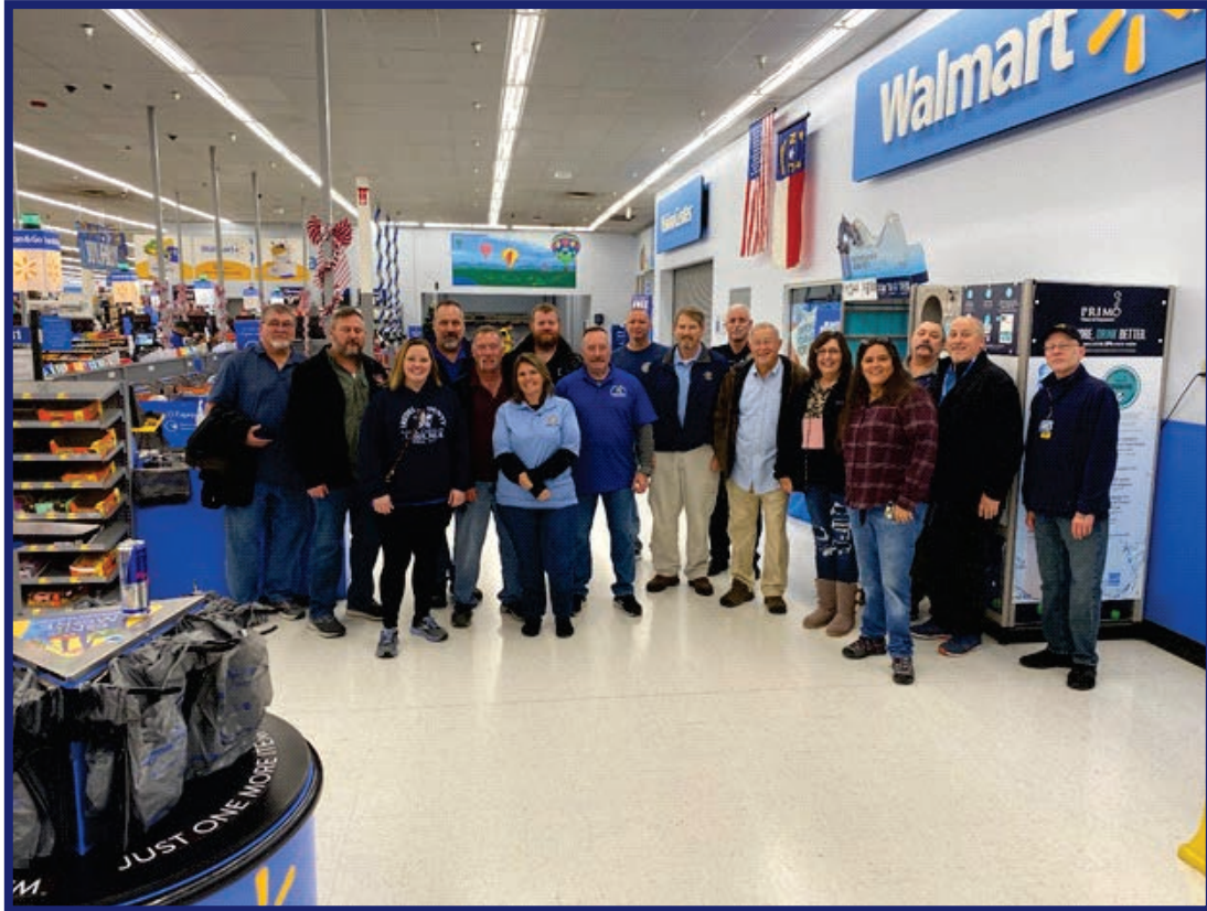
Iredell County Lodge 10 Executive Board Members, Active Members, and Walmart Employees.